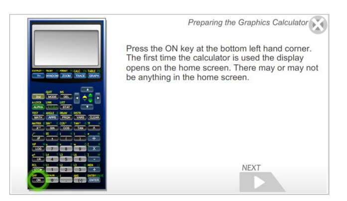
Figure 2b. Screen shot of a T&A image of the e-book in a "pop-up" window.