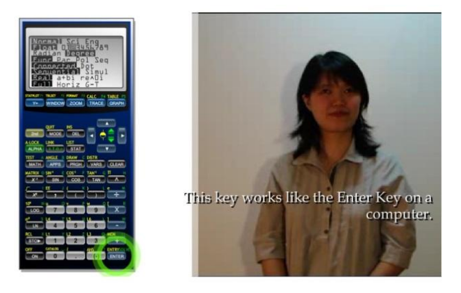
Figure 3b. Screen shot of a T&M image of the e-book in a "pop-up" window.